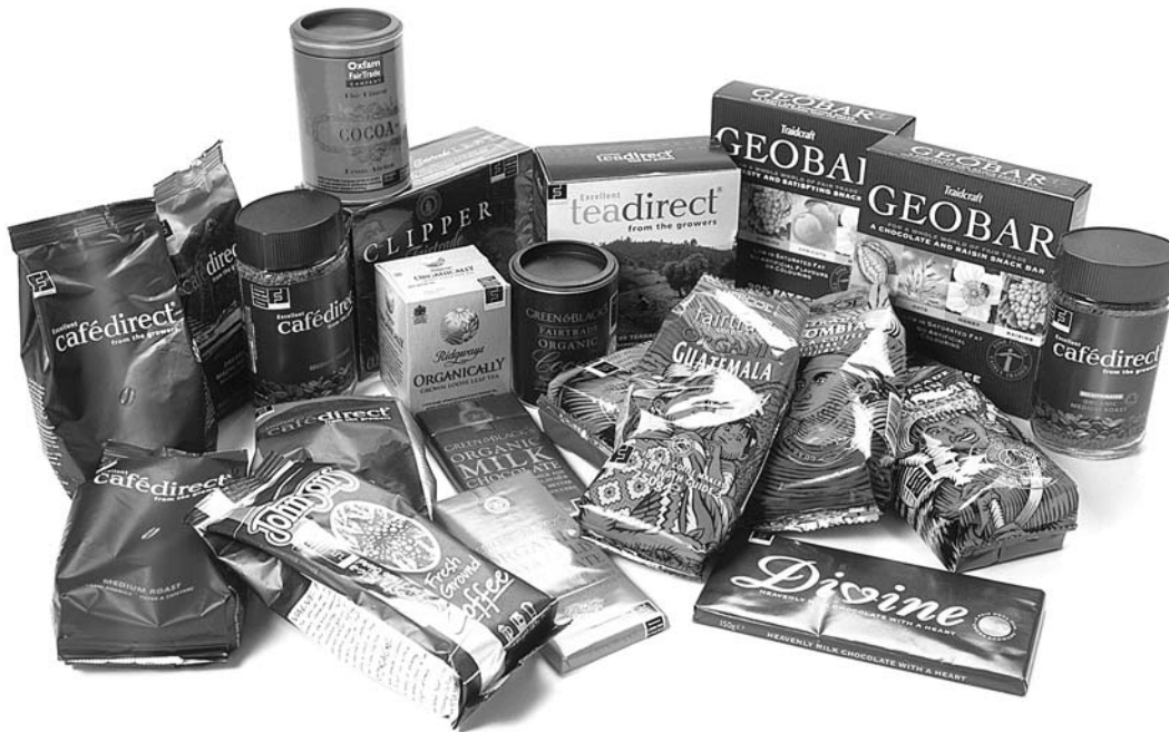
Examples of the Sainsbury's Fair Trade range – part of the supermarket giant's selective approach to integrating CSR.

able sources, its meat and vegetables are organic, and it bans from its shelves artificial products with too many e-numbers. Moreover, Whole Foods' employees, known as 'team members', are encouraged to participate in charitable activities in company time. It also prides itself on constantly setting new standards for using alternative energy to power its stores. The results of this integrated strategy are evident in Whole Foods' success, with double-digit growth rates over the past couple of years.