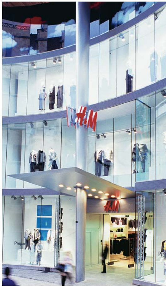
The flagship H&M store in Brussels. H&M is a brand that has an impeccable CSR record, but keeps its CSR activities behind closed doors.

As the preceding examples demonstrate, there is more than one way to create a suc-